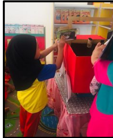
Children match and paste the picture cards